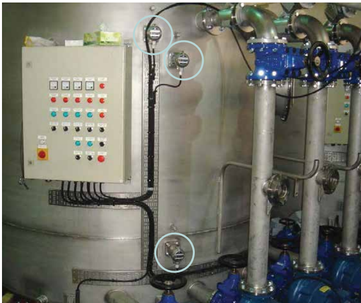
Level switch type: A 01 051E15