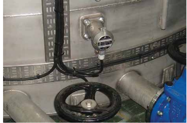
Level switch type: A 01 051E15, see also page 4

We offer standard range and mini float switches, as well as level indicators and transmitters for applications in water management. Besta has been certified according to ISO 9001 since 1991. Production and internal processes are continuously monitored by the installed management system, to ensure that you can trust our products.